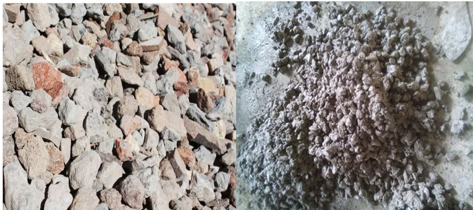
Fig1. (i) Recycled Concrete (ii) Natural Concrete