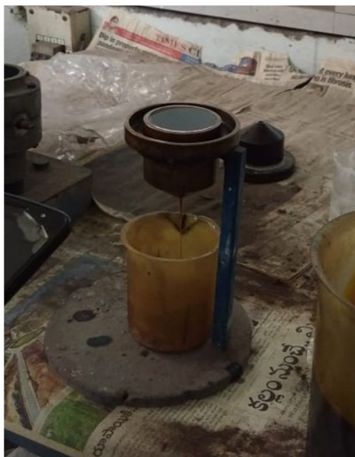
Zahn Cup Viscometer