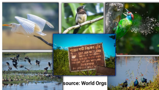
Figure 2 Biodiversity of Satajaan