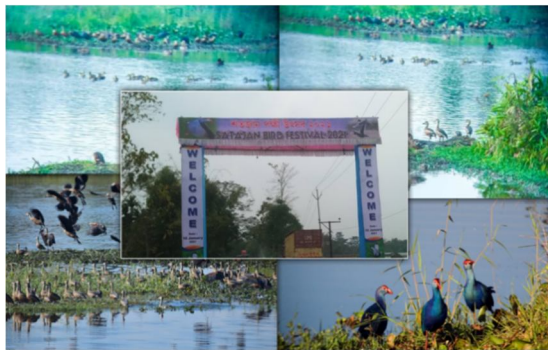
Figure 3 SATAJAAN BIRD FESTIVAL 2021