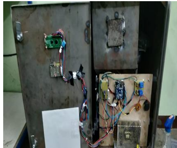
Fig 1: Fabrication of Smart Storage and Dispensing Machine for Food Grains Fig 2: Internal Components of the Machine