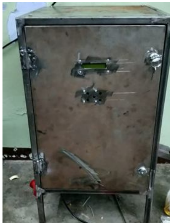
Fig 3: Front view of the Machine