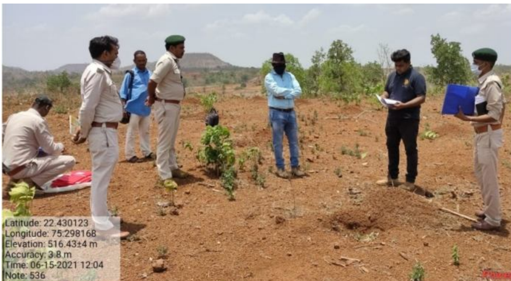
Pit work, CPT and contour observation in study area