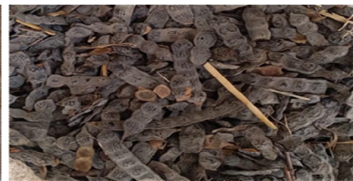
Acacia nilotica (L.) Del.