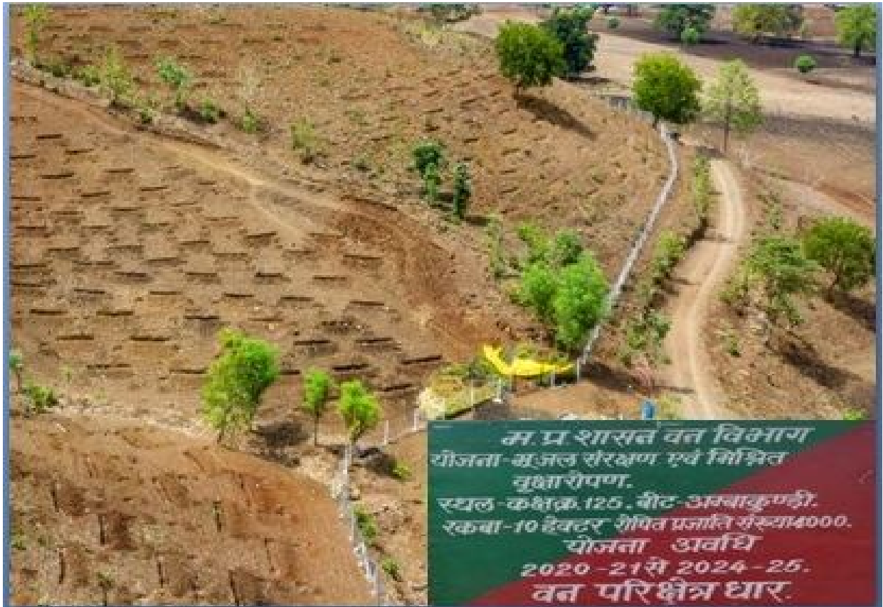
Contour trench in study area