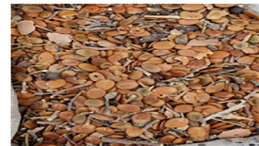
Albizia amara (Roxb.) Boiv.