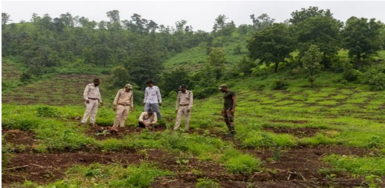
Seed germination observation in the different field