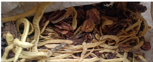
Prosopis cineraria (L.) Druce