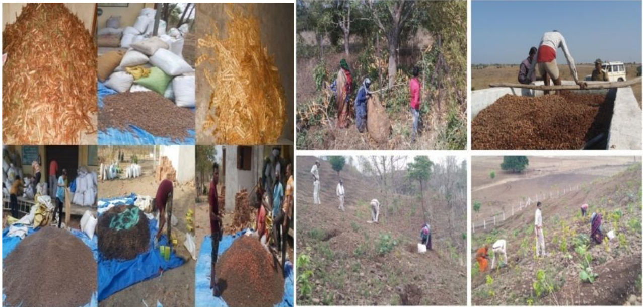
Different varieties Seed collection and treatment after showing