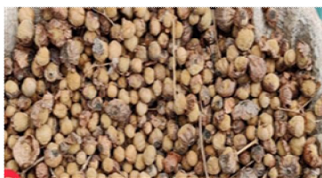
Tectona grandis L.f.