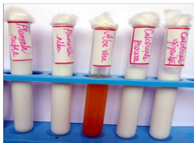
Figure1 : Latexes of various plants