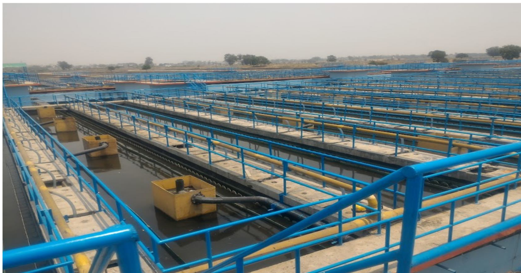
Fig. 2. Sewage Treatment Plants in Lucknow