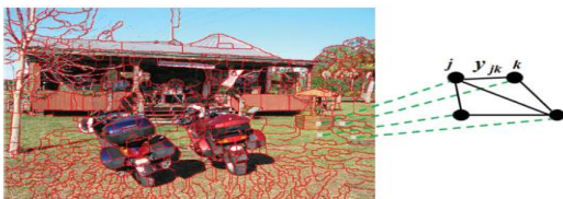
Fig 3.2 Illustration of a part of the graph built on superpixels.

A Database of partitioned images is created by any partitioning method, such that any task specific partitioning method can be used to make the database. A Query image is inputting to the system. It is partitioned to regions. Then similarity between query image and images in database is calculated. Then the maximum similar images are retrieved. This similarity measurement includes regionwise similarity and total similarity measurement. The image is taken, then