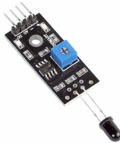
Figure 2: Flame Sensor

coefficients [10]. Huan Li designed a novel algorithm for fire detection in video for industrial application. He and his team named their project as Color Context Analysis based Efficient Real-time Flame Detection Algorithm (CCAFDA). The algorithm uses flame detection context based dynamic feature row vector and optical flame feature area vector to select the flame region in a frame [11]. Thermoelectric detectors work by applying various thermoelectric properties of metals, using these there has been a high rate of success in detecting fire. This concept works based on generation of voltage between bimetallic junctions, which is figuring out the various heating points of metals at which the resistivity changes. During events of rapid increase in temperature this method has proven to be very effective [21].