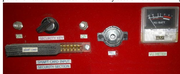
Fig. 3 Security section

To prevent the system to be used or make any changes in the system settings by any unauthorized person, security modules comprising security key, card and power on card were used. The security section is shown in figure 3.