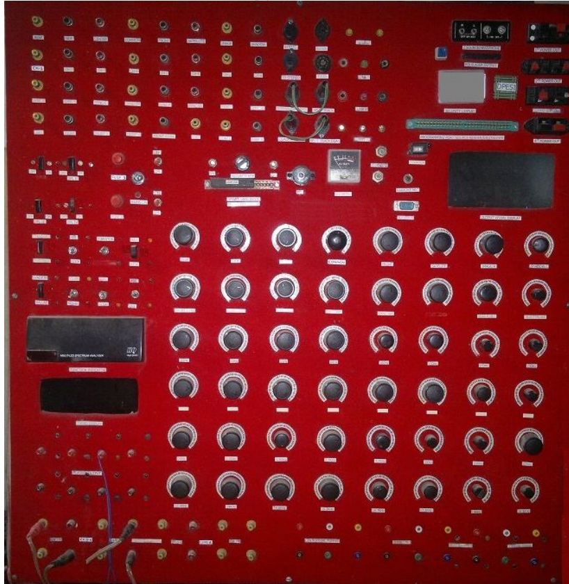
Fig. 5 Dplesi panel