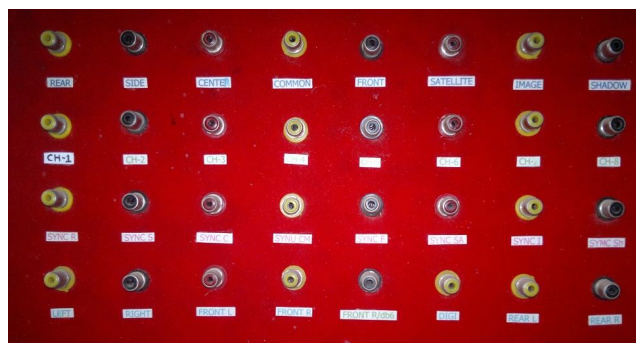
Fig. 2 32 lines Input

The output and input connections are through A/V ports so that there is an ease for plug and play. The 32 input lines are shown in figure 2. More ever many multi input and multi output ports have been used to make the system free from mesh of wires. Proprietary connectors are also used to combine several different wires into one connector. It is done to reduce cable clutter and for the ease of installation.