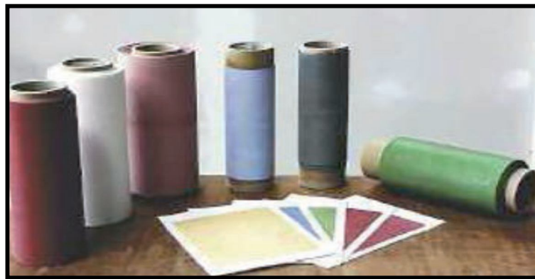
Fig 4. Ceramic Plates with Cnc-Flex Nanotechnology Coating Processes Are Thinner And More Flexible Production

Multifunctional: other examples of nanotechnology-based coatings, films (var p in) flexible ceramic, wall tiles in the kitchen and places health as used in the manufacture of a flexible ceramic substrate with glue (crosslinking) is used. Next, the ceramic composite ceramic paint and a colorless garment worn. In addition, other functions such as anti-UV properties and hydrophobic properties are to be added at a later stage. As a result, widely and easily with features multi-functional wall coverings withstand pollution, fire and chemicals is made.