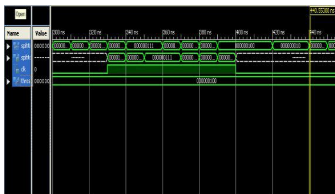
Figure 2 internal structure for arithmetic coder

Simulation for spiht module where spiht lists output only for values greater than threshold is as in the figure