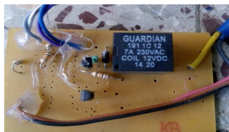
Fig 2 Electronic Circuit

The electronic circuit mainly consists of the components namely Power supply, Power supply connector, Voltage regulator, Resistors Voltage divider, Infrared emitter connector, Infrared sensor connector, Transistor Valve, connector Comparator.