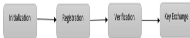
Figure: Identity-Based Key Asymmetric Management Scheme

In this scheme a trusted key generation center is needed. Generally this scheme consist four layers of key exchange process. Initialization, registration, verification and key Exchange. To verify the user identity and generating the corresponding private keys this scheme needs trusted key generation center. RSA scheme is used to construct the private-public key pair; each mobile node in MANET gets his long term public and private key pair. The secret key as a master key is chosen by key generation center randomly as well as publish its corresponding public key. In the initiation phase, each user receives his long term public and private key pairs by the generation center. The generation center randomly chooses a private key for each node and publishes its corresponding public key. Next, the user registration phase where each users sends his ID to the generation center that provides him with his signature. In the user verification phase, users who wish to communicate challenge each other before generating the session keys in the key exchange phase after the security analysis of this model, it provides end-to-end authenticity and it prevents the network from brute force attack, man in a middle attack and from replay attack. Mobile nodes have no need to producing their public key and to