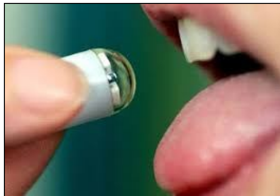
Fig.2. Principle of Capsule

It is a capsule when swallowed can detect all the abnormalities inside a body and transmit the information about the abnormalities outside the body. And it can come out of the body by bowel movement after use.