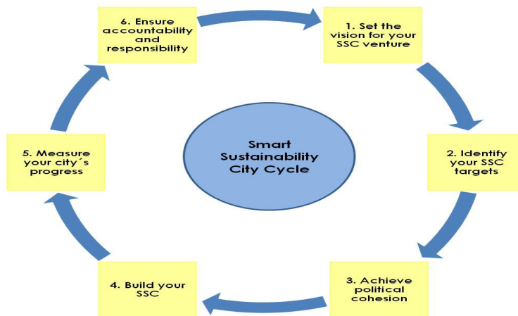
Figure 2: Smart sustainability life cycle

There is need for international consensus on what “smart and sustainable city” means, and deeper understanding of how approaches labelled as “smart” advance the new urban agenda. The assumption that the application of ICTs in planning, design and management of urbanization and cities will automatically result in improved outcomes needs to be addressed. This is a long term process and cannot be achieved overnight. Transitioning or building a city into a smarter, more resilient, more sustainable city is a journey and every city is likely to have different pathways. This is a long term process of actions that would not only allow for comparability but would also promote sustainable development along with each city being able to quantify improvements. Cities are accountable for continuous improvement to strengthen its effectiveness for the future. Therefore the process should be able to adapt to the dynamic, evolving and complex nature of cities and be able to continuously update the vision as required.