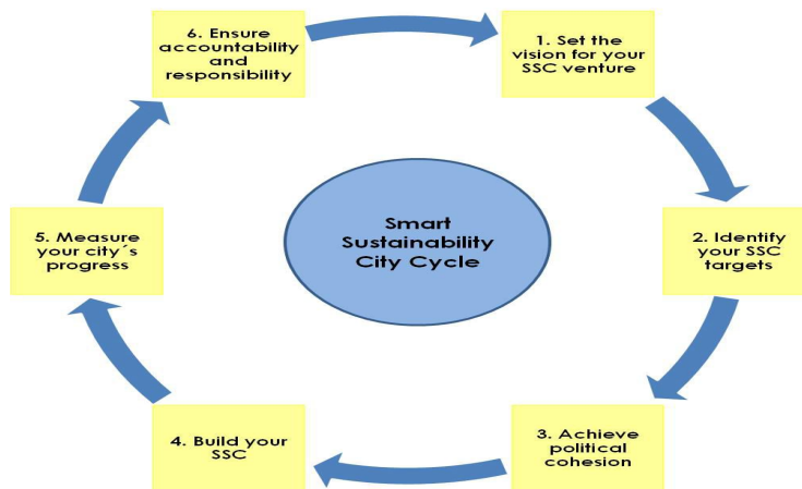
Figure 2: Smart sustainability life cycle

There is need for international consensus on what “smart and sustainable city” means, and deeper understanding of how approaches labelled as “smart” advance the new urban agenda. The assumption that the application of ICTs in planning, design and management of urbanization and cities will automatically result in improved outcomes needs to be addressed. This is a long term process and cannot be achieved overnight. Transitioning or building a city into a smarter, more resilient, more sustainable city is a journey and every city is likely to have different pathways. This is a long term process of actions that would not only allow for comparability but would also promote sustainable development along with each city being able to quantify improvements. Cities are accountable for continuous improvement to strengthen its effectiveness for the future. Therefore the process should be able to adapt to the dynamic, evolving and complex nature of cities and be able to continuously update the vision as required.