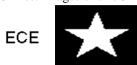
Figure 4. Watermark Images of size 64 \times 64