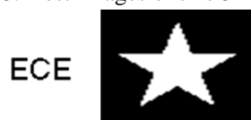
(a) Binary image ECE (b) Star Figure 4. Watermark Images of size 64 \times 64