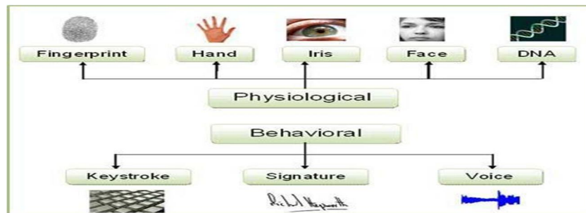
Fig. 1 Classification of Biometric System

Biometric deals with the authentication of individuals based on their physiological and behavioral characteristics. The Behavioral characteristics refer to the behavior of a person which includes typing rhythm, voice, gait, keystroke, signature etc and the Physiological characteristic refers to the feature or outline of individual body which includes finger print, iris, ear pattern, DNA, palm print, face etc. [1]