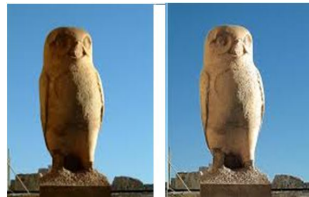
(a) Original Image (b) Output Image

Using an criteria the neo linear big difference development needs the histogram equalization process. The drawback of neo linear big difference development is normally that that the each price of data image contain a several prices within the production image for this reason the initial item decline their right brightness. Figure 3 illustrates an perception image as well as the production photograph. It clear the big difference between your both images.