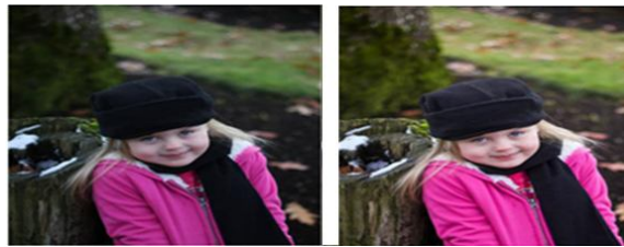
(a) Before Enhancement (b) After Enhancement