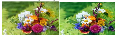
(a) Original image (b) Output AHE