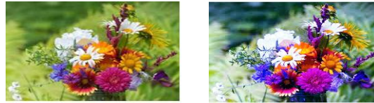
(a) Input Image (b) Output Image