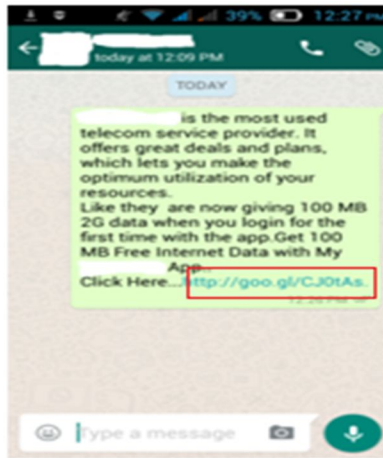
[ Fig.4 Attractive Message ]

figure showed that in Whatsapp sent an attractive message with a malicious link.