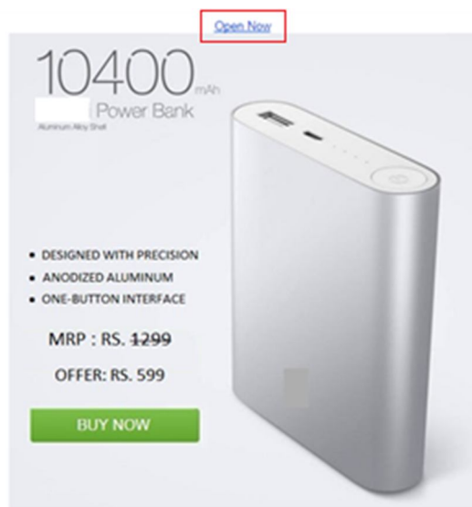
[ Fig. 1: Attractive e-mail image ]

The Terrorist group creates online shopping offers attractive e-mail and sent it to the victim. In this e-mail power bank shopping discount image and one link is provided for more know more about the power bank details as shown in a figure.