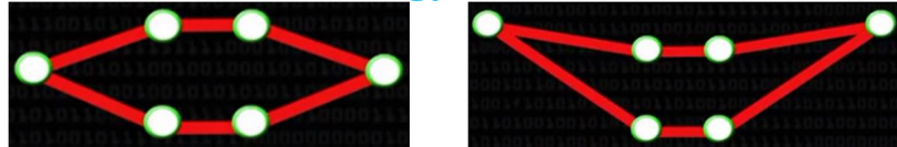
Fig. 1. Neutral and smiling view