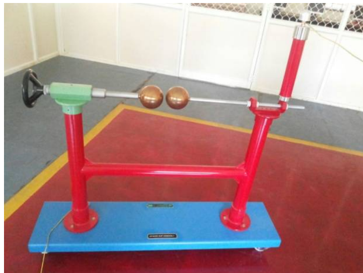
Fig. 3 Connection of Electrodes