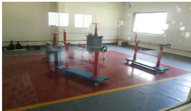
Fig. 1 High Voltage Laboratory

The sphere-sphere electrode gap is one of the standard methods for the measurement of peak value of AC and impulse voltages and is also used for checking the high voltage power equipments and other voltage measuring devices used in high voltage test circuits. In this, two similar aluminium spheres are separated by certain distance form a sphere gap with air medium. Also, care is taken such that the gap length between the spheres should not exceed a sphere radius. If these conditions are satisfied and the specifications regarding the shape, mounting, clearances of the spheres are met, the results obtained by the use of sphere gaps are reliable to within \pm 5\% . It was suggested in specifications that the readings are to be taken in places where the ultraviolet radiation is low. Irradiation of the gap by radioactive or other ionizing media should be used when voltages of magnitude less than 50 kV are being measured or where higher voltages with accurate results are to be obtained.