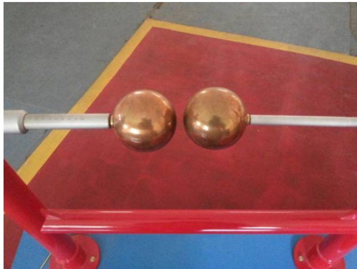
Fig. 2 Sphere-Sphere Arrangement

For taking readings practically, two transformers each of capacity 50kV are cascaded to give 100kV capacity are taken. Standard spherical Electrodes of 5cm radius, control panel for safe application of voltage and earth rod for discharging the stores charges have been employed.