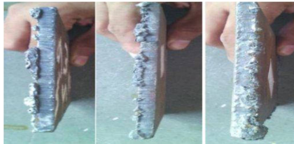
Fig.1 Gas cutting by LPG but good finishing not obtain [3]

Now a day's optimization is essential process of an industry whether it is in form of process, cost, equipment, etc. In the welding cutting process according to various material various gas is utilized & gas is one of the energy producer (generator) material & it is our conventional energy source so to reduce gas utilization is our motto for full fill our motto in this research world we are 3 parameter of gas cutting is apply for the optimization MRR our research going on material M.S., C.I. C-45 sheet (thickness vary 6mm, 8mm 10mm). [3]