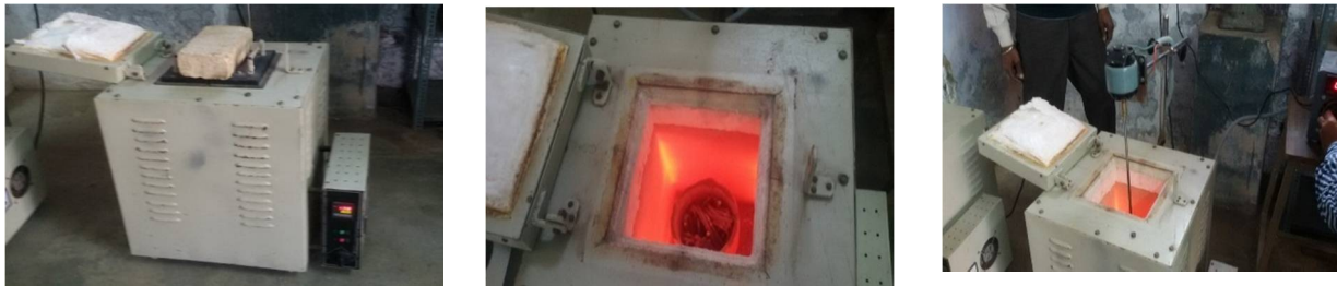
Fig. 1. Stir casting setup

The process of introducing SiCp into the molten matrix was done in two consecutive steps with 5% by weight each time. This was done to get more uniform mixing and to reduce the formation of clusters of SiCp into the molten matrix. The preheated SiCp 5% by wt. were then added to the side of the vortex formed. The pressure difference induced by vortex, works as the acting force to get the SiCp deep into the molten aluminium and across the radius of vortex. This phenomenon helps in uniform mixing of SiCp into the molten matrix. The stirring was continue for 5 min while the temperature of the furnace was set at 900°C. After completion of the first mixing step, again 5% SiCp (5% of initial Al 6061) were added to the molten aluminium that already contains 5% SiCp, to complete the final stage of mixing. So, overall 10% by wt. SiC particulates were added.