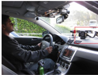
Fig .4. Interactive guide for learning driving

This usage will give a standard in issuing a driving permit to a man through a mechanized framework that investigates the driving example of that individual and accepts whether the individual is a qualified one or not to get the license. Apart from this as the procedure of approval is automated both the validator and the candidate are kept from the demonstration of the bride. This framework likewise averts street mishaps brought on by heedless drivers as they are dispensed with from getting their permit through the computerized framework. The scope of this proposal apart from the issuance of the driving permit is that they can be used in driving schools to give a consistent and timely feedback on the performance of the learner throughout his course so that he could improve himself .It can also act alike a human guide (as shown in Fig 4) if interactive features can be added to this framework. This would make the system more dynamic as the feedback would be given for each and every move of the learner.