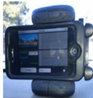
Fig .2. Smart Phone Mounted To Car Dashboard

Information is gathered from accelerometer sensor present in Cell phone utilizing a committed application. All estimations of accelerometer sensor i.e. x, y and z are brought from Cell phone's inside administrations. While gathering the information, the telephone is set at an altered area at the dashboard of the vehicle in picture mode as appeared in Fig 2.