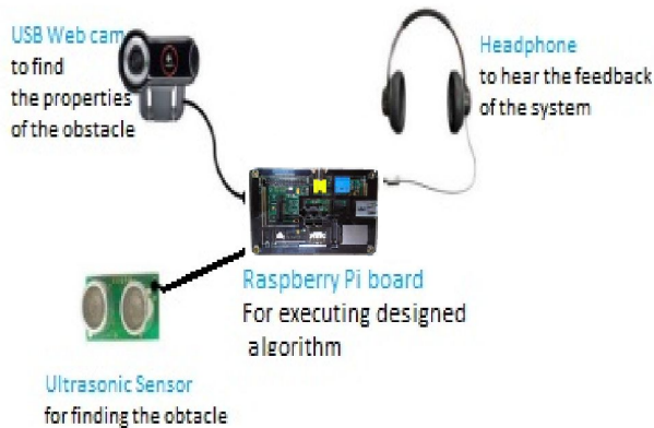
Figure 1. Proposed Navigation System