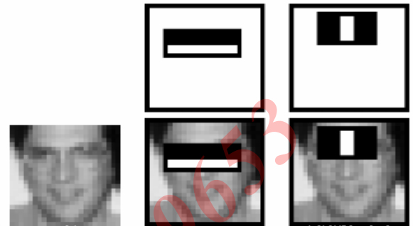
Figure 3. Eye Detection using Haar Cascade

But among all these features we calculated, most of them are irrelevant. For example, consider the image below. Top row shows two good features. The first feature selected seems to focus on the property that the region of the eyes is often darker than the region of the nose and cheeks. The second feature selected relies on the property that the eyes are darker than the bridge of the nose. But the same windows applying on cheeks or any other place is irrelevant. So how do we select the best features out of 160000+ features? It is achieved by Adaboost .