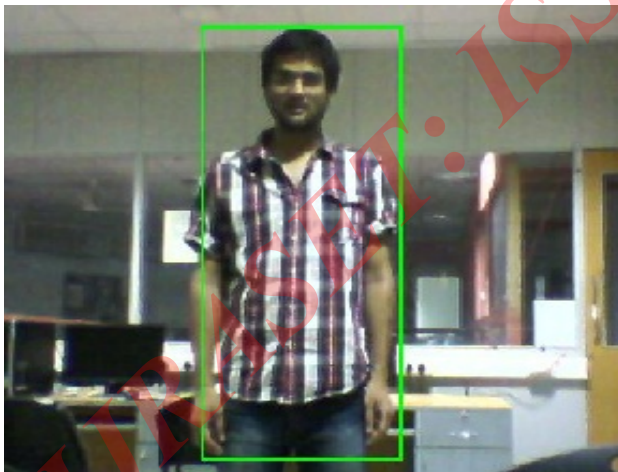
Figure 6. Human Detection using HOG Descriptor

To recognize persons at different scales, the image is subsampled to multiple sizes. Each of these subsampled images is searched. The programme sample is being tested as below snapshot .