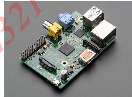
Figure 7: Raspberry Pi Model B Board

The board as shown in figure 5 can be purchased preassembled; the software can be downloaded for free. The hardware reference designs (CAD files) are available under an open-source license.