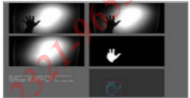
Figure 6: Object Detection Pattern using Open CV

Open CV (Open Source Computer Vision Library) is a library of programming functions mainly aimed at real time computer vision, developed by Intel and now supported by Willow Garage. It is free for use under the open source BSD license. The library is cross-platform. It focuses mainly on real-time image processing.