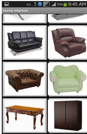
Fig 4: Product List