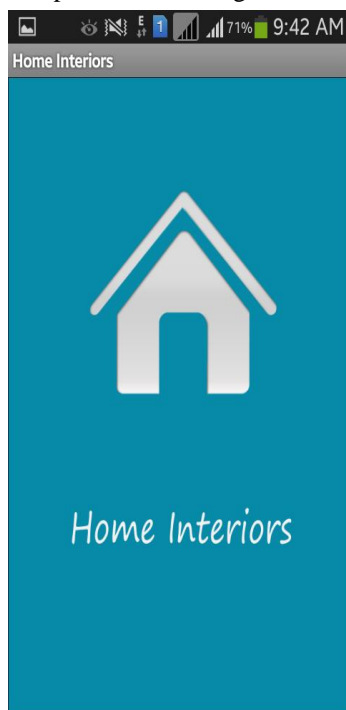
Fig 2: Splash Screen