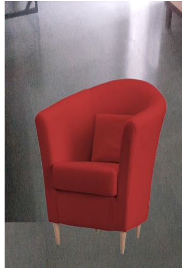
Fig 5: Augmented Furniture