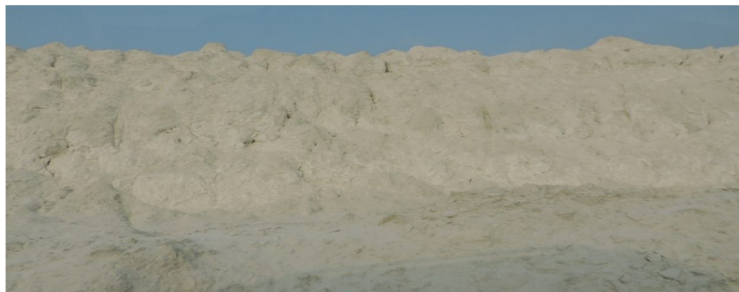
Snow city at Kishangarh made up of marble slurry

The Indian comedian Kapil Sharma is among those who have used the dump as a location for shooting. It is one of the manmade landforms that prove that our impact on our planet Earth can be beautiful. The snow white background makes pictures vivid. The white expanse is not snow, but marble slurry, spread all over an area that serves as the dumping yard for Asia's biggest marble trading centre. All day with tractors offloading marble slurry, this expanse was allocated by the Rajasthan government to the Kishangarh Marble Association in the 70s as a dumping yard.