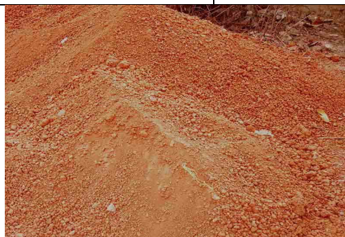
Figure 1 Laterite soil