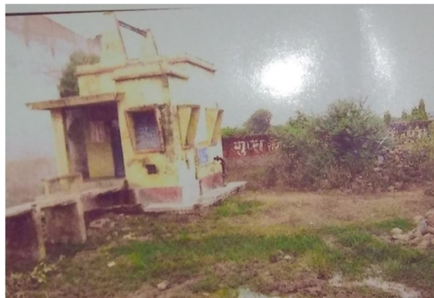
S 6 –Navnirmit Charkhari Baipass