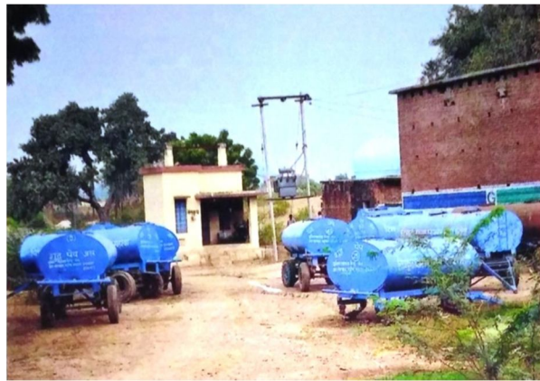
S 1 - Charkhari Baipass

Total six water samples were collected in summer season 2015, from different stations (Charkhari baipass, Bhatipura, Subhash Nagar, Ram leela Maidan, Bajaria, Navnirmmit Charkhari Baipass) in Mahoba city (Table-1) all the samples were collected in sterilized bottles D.O. bottles and were stored at 4 0 C till further investigation, samples were collected from the sites in between 9.30- 11.00 am, Physico chemical analysis of water samples were carried out using standard methods APHA (Trivedy and Goel 1980). Physico-chemical factors colour, Turbidity Taste, odour, PH, total hardness, Total dissolved solids, chloride and D.O. Fluoride, and total alkalinity were analyzed as per the methods given in APHA (2005).