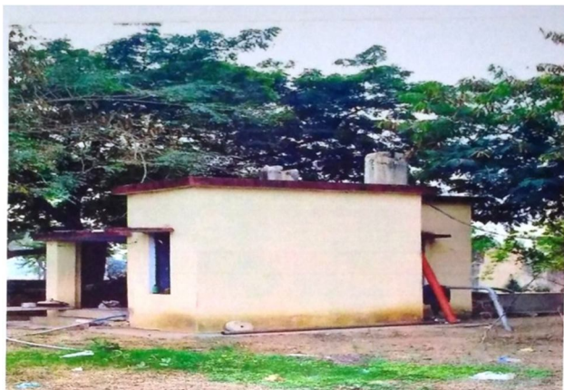
S 5 –Bajariya