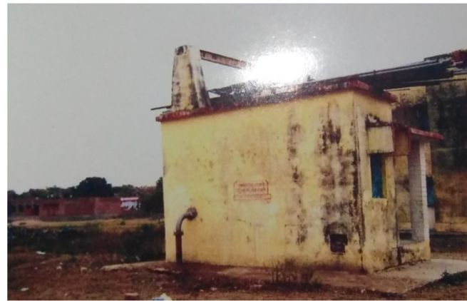
S 2 - Bhatipura