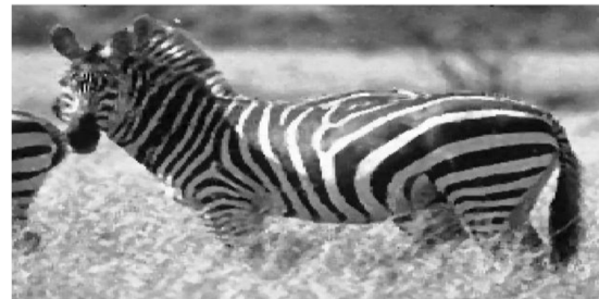
Denoising median filter

The SUMF is an example of a non-linear filter and, if properly designed, is very good at preserving image detail. To run a SUMF Consider each pixel in the image Sort the neighboring pixels into order based upon the intensities