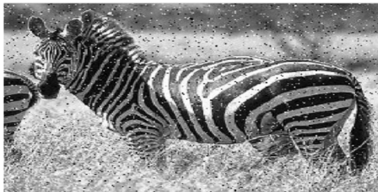
Salt and pepper noise

An improved median filtering algorithms for image noise reduction the algorithm used the correlation of the image to process the features of the filtering mask over the image[6]. In median filter first 3 \times 3 sliding window is taken, and checked whether the 5 th pixel of the corresponding window is noisy then the respective pixel value is replaces by median value of the current sliding window. MDNF is in a sense a more robust, "average" than the mean as it is not affected by outliers. Since the outpixel value is one of the neighboring values, new "realistic values are not created near edges. Since edges are minimally degraded, median filters can be applied repeatedly if necessary[7].