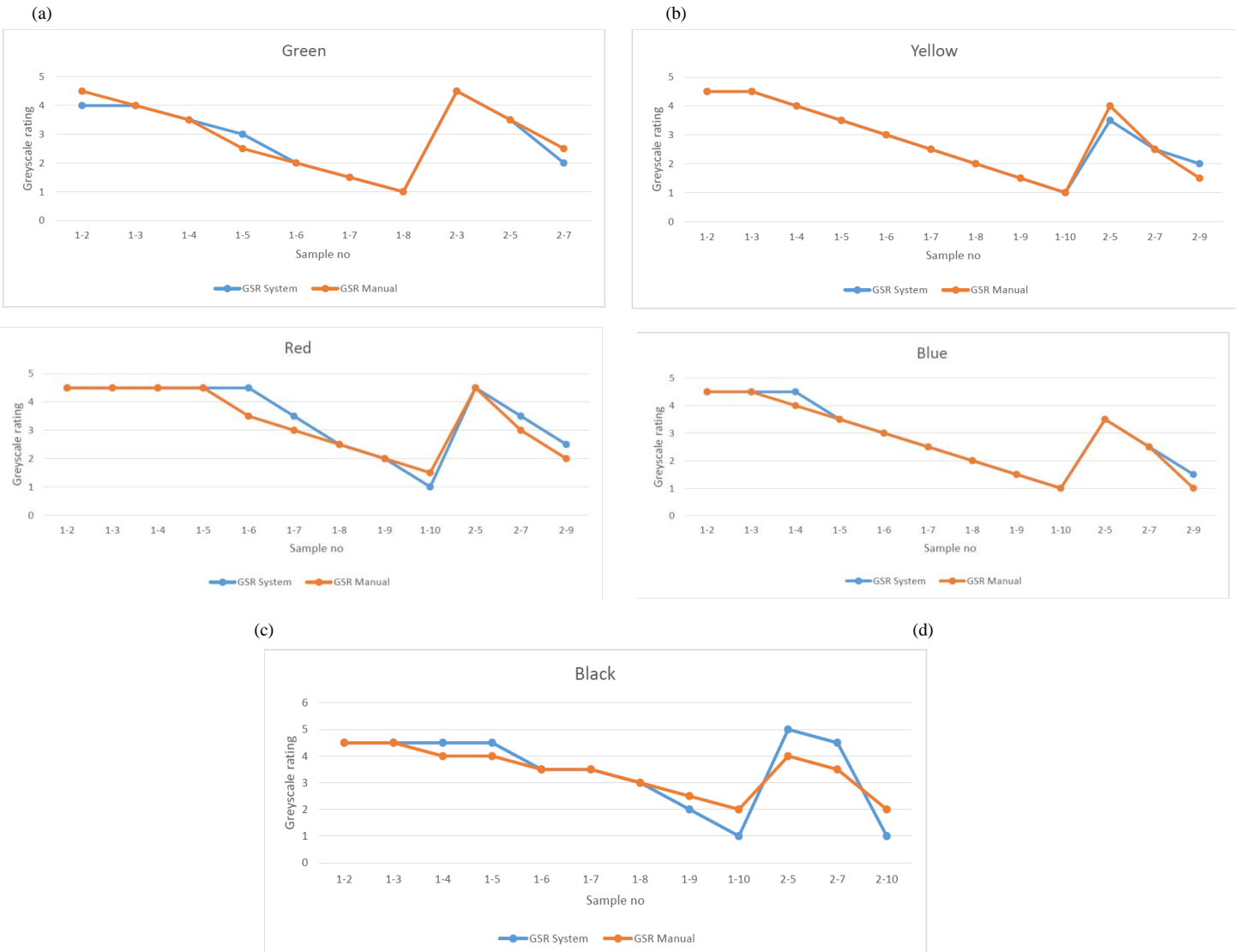
(e) Fig. 3 Manual & computerised grey scale ratings of fabrics

A large number of fabric samples of five different colours, namely black, red, green, yellow and blue were selected and tested. The test results were compared with the ratings obtained from manual assessment by expert assessors from the industry. The following graphs show the comparison between the manual rating and the computerised rating by the proposed system.