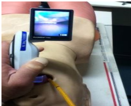
Figure 4 : over video laryngoscopy

The patients were placed in the supine position with their head on a 7 cm headrest. General anaesthesia was induced according to the preference of the attending anesthesiologist. The attending anesthesiologist decided when to start the intubation attempt and the time for the procedure was then noted.