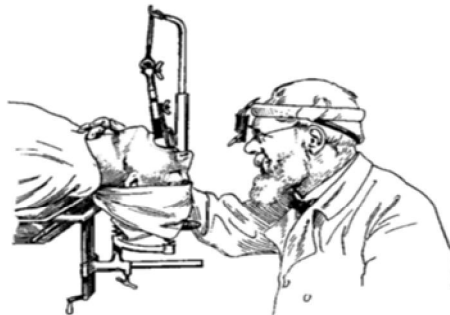
Figure 1. Gustave Killian performing suspension laryngoscopy, 1919. The patient's head is suspended by attaching the laryngoscopy to the "gallows".

The history of laryngoscopy, as that of all medicine is rich in personalities and anecdotes. Advances that we take for granted in contemporary practice did not evolve in an orderly fashion. The convention that an idea is born, recognized and accepted in orderly progression is an illusion. Inventive minds circle around problem, at times encouraged by other technologic advances or by boldly discarding outdated dogma. Ideas are proposed, rejected, reinvented and eventually accepted in an ascending spiral that advances medical knowledge.