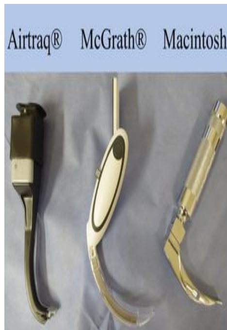
Figure 2. Types of Video Laryngoscopes

Hyper angulated VL blades often allow super laryngeal visualization with the down side that tube delivery requires a different technique with an angulated stylet, were as Macintosh style blades allow for the use of the same tube delivery technique through direct laryngoscopy or indirect laryngoscopy.