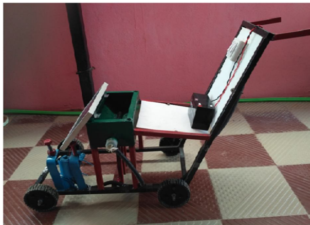
Fig 3: Model setup of a Solar powered digging and seed sowing machine