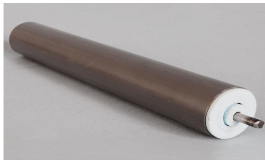
Fig 2.1 Roller