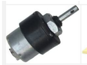
Fig.2.3 DC generator

An electrical generator is a device that converts mechanical energy to electrical energy, generally using electromagnetic induction. The source of mechanical energy may be a reciprocating or turbine steam engine, water falling through a turbine or waterwheel, an internal combustion engine, a wind turbine, a hand crank, or any other source of mechanical energy.