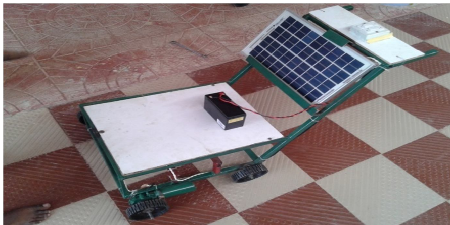
Fig.2: working of hybrid power grass cutter

Advancing of the working of sun oriented powered grass cutter, it need panels mounted On An specific course of action during a point from claiming 60 degrees over such an approach that it could get sun based radiation for helter skelter force effectively from the sun. These sunlight based boards change over sun oriented vitality under electrical vitality Concerning illustration mulled over sooner. Right away this electrical vitality may be put away On batteries Toward utilizing a sun oriented charger. The primary capacity of the sun oriented charger may be should expansion the present starting with the panels same time batteries need aid charging, it Additionally disconnects the sunlight based boards from those batteries The point when they need aid completely charged Also likewise associate of the panels when those charging in batteries will be low. The engine is associated with those batteries through interfacing wires. The middle of these, two mechanical circuit board switches will be given. It begins What's more stops the attempting of the engine. Starting with this motor, the control transmits of the instrument and this makes those sharpened steel should slide on the settled sharpened steel Also this makes should slice the grass.