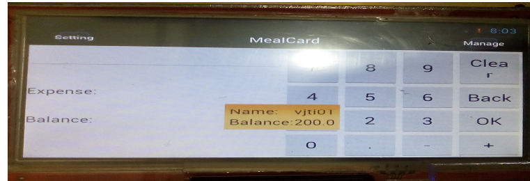
Figure IV: The information in card displayed as card is kept on RF reader.

The figures IV and V depict the GUI of Android App built for the system. When the card is detected on the electromagnetic region of RF reader, the information stored in card ids read and displayed on the app. Refer figure IV for this.