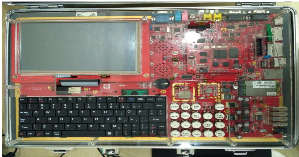
Figure I: CES-IOT210 system

CES-IOT210 IOT system box is an integrated internet of things experiment set up, which focuses on the networking perception layer, the network transport layer, the application layer, three layer technology. The system's perception layer consists of various sensors (such as temperature sensors, photoconductive sensors and vibration sensors), RFID radio frequency modules to realize the different physical characteristics of information collection, the network layer by the Internet of Things one of part being ZigBee which is a short-range data communication tasks of information, as well as Wi-Fi, Bluetooth, 3G, GSM and other technologies to achieve a variety of different network transmission function. The application layer of Internet of things technology is uppermost layer, constituted by senior Internet of Things gateways, data the processing of information and the upper application development. The table I describes the specifications for this IoT system box.