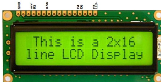
Fig 3. LCD Display

LCD stands for liquid crystal display. It is used in this circuit to show the amount of fertilizers in the soil so that we can check whether the amount of fertilizer being distributed is correct or no. We are successful to use a 16x2 LCD i.e. it has 16 characters and 2 lines of display size. The LCD collects control signal from the microcontroller; it decodes that control signal and performs the equivalent actions on LCD. Once the initialization arrangement is done, it displays the soil parameters. It is used to display the quantity of fertilizers in the soil.