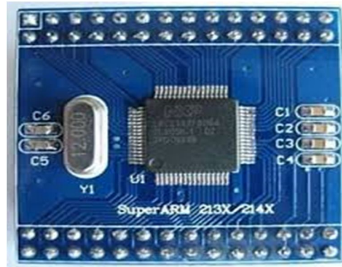
Fig.4 LPC 2148