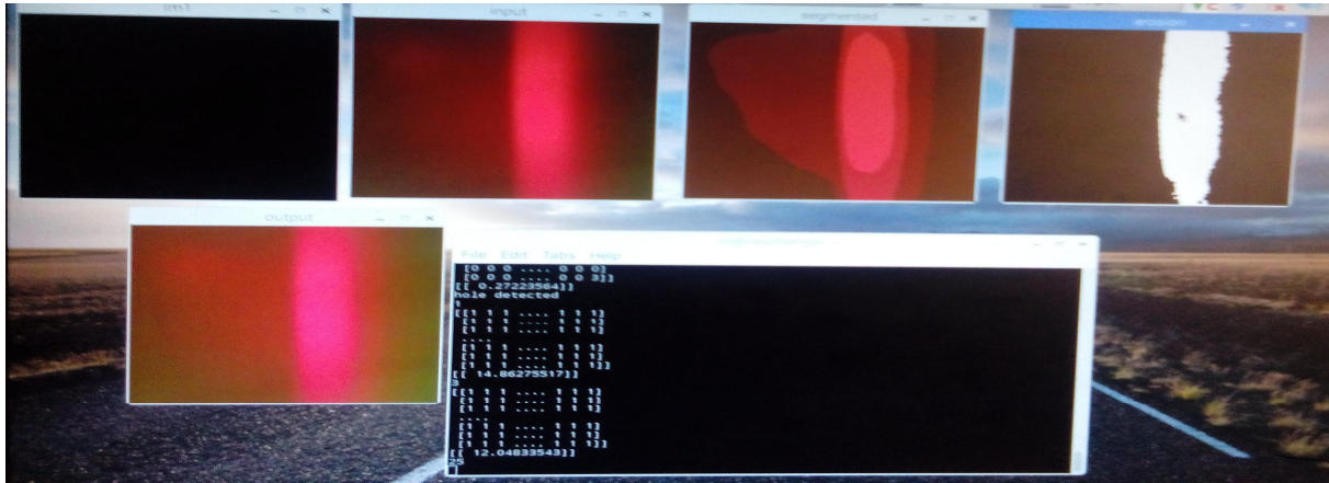
Fig 6: Software output for path hole detection