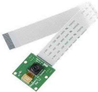
Fig 3: Raspberry Pi Camera.

GSM makes use of a narrow band time division multiple access (TDMA) technique for transmitting signals. GSM was developed using digital technology. It has an ability to carry 64kpbs to 120Mbps of data rates. Presently GSM supports more than one billion mobile subscribers in more than 210 countries throughout the world. GSM provides basic to advanced voice and data services including roaming service.