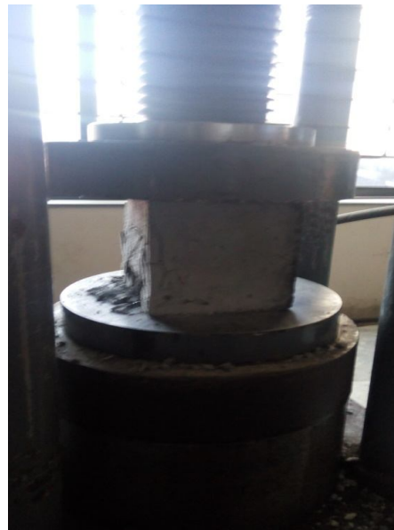
Fig. 1 Compression test