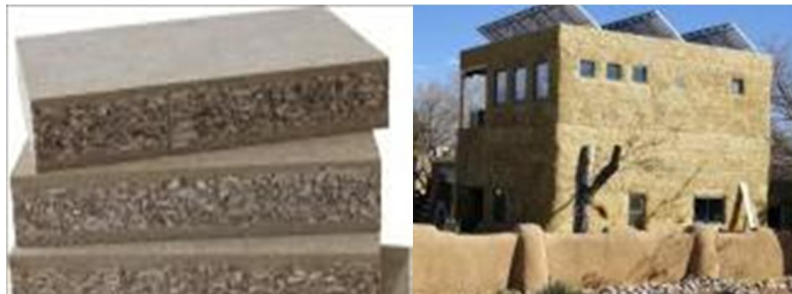
Figure 3: Use of Rice Straw/Wheat Straw

The rice and wheat straw bale buildings are the cheaper and stronger and are constructed with easily available more materials to the rural people these buildings are light and can be used as earthquake proof houses and using straw they have tested on shaking table and have achieved good results .