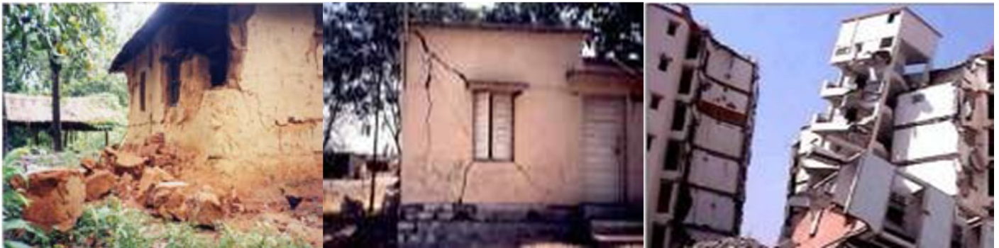
Figure 1: Effect of Earthquakes Buildings

The most frightening and destructive phenomena of nature is a severe earthquake and its terrible aftereffects an earthquake is a sudden movement of the earth caused in the abrupt release of strain that has accumulated over long time for hundreds of millions of years the forces of plate tectonics have shaped the earth as the huge plates that form the earth surface slowly move over the under and past each other sometimes the movement is gradual at other times the plates are locked together unable to release the accumulating energy When the accumulated energy grows strong enough the plates break free if the earthquake occurs in populated area it may cause many deaths and injuries and extensive property damage. Earthquakes are caused the movement of the earth tectonic plates earthquakes occur where the earth plates meet along plate boundaries see plate tectonics page for more information on this for example as two plates move towards each other one can be pushed down under the other one into the mantle If this plate gets stuck