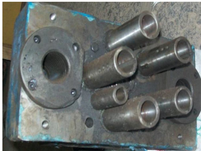
Fig.2. fixed drilling machine