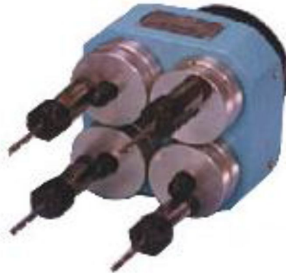
Fig.1 Fixed drilling machine