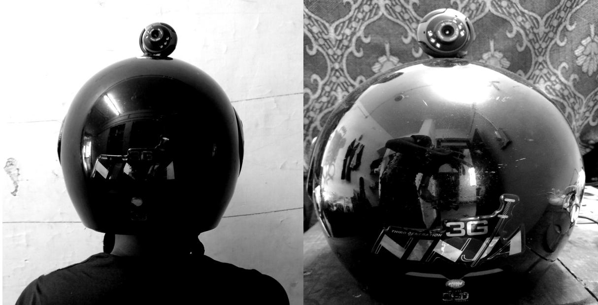
Fig. 1 Camera mounted on helmet.

The design of the system can be divided in two parts, hardware and software. In hardware, basic component Camera is included which is mounted on helmet at a perfect position facing backwards so that it can record the traffic scenario exactly at the back of the two wheeler. This recorded video can be processed for the detection of vehicles. Another hardware component that is important is the warning device which can be a simple speaker to convey the information to the two wheeler rider about the traffic behind.