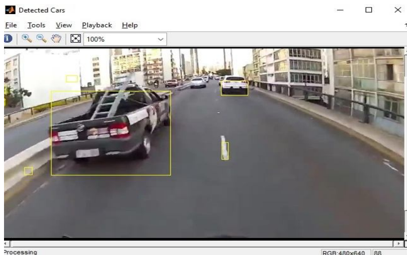
Fig. 3 Output showing the vehicle being detected.