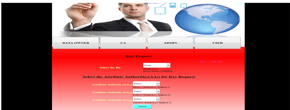
Figure 4: User's Key Request to Admin