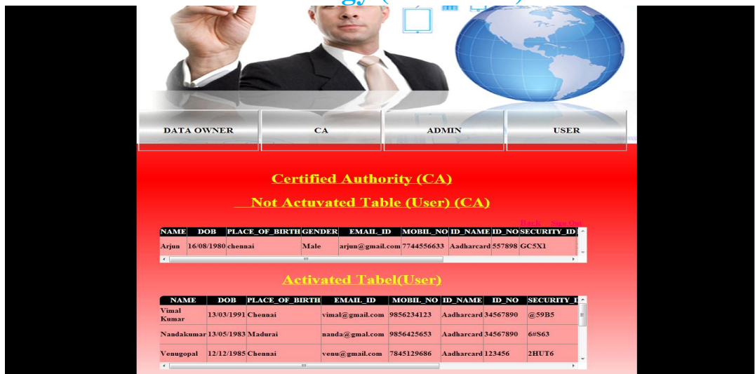
Figure 3: Account Activation by CA