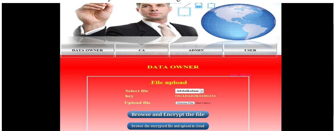
Figure 1: Owner Receiving Public key Key and Uploading Encrypted file

The results of Threshold Multi Access Control System in Cloud Storage are as follows.