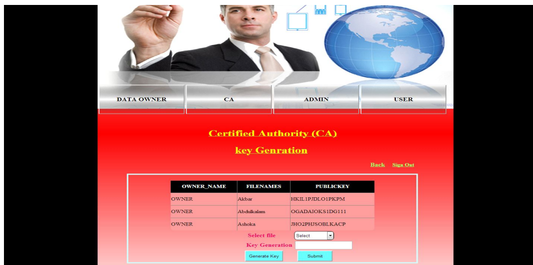
Figure 2: Public Key Generation By CA