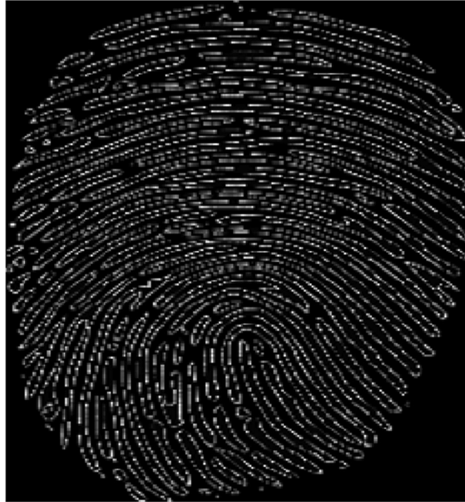
Fig 3(B) Encrypted image

The Fig 3(A) shows the input image. The finger print image is in scalable vector graphics in an extensible markup language(xml). This is the document formatting format. The svg images can be created and edited with any text editor. This images can be printed with high quality at any resolution. The Fig 3(B) shows the encrypted image. The encrypted text file is given to the MATLAB .Here the text file is converted into image. This finger print image is called as encrypted image.