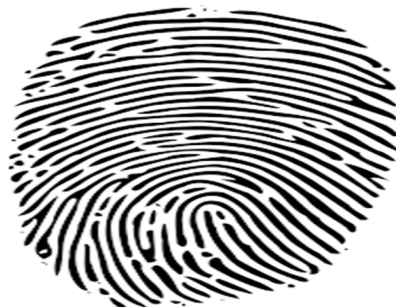
Fig 3(A) Input image