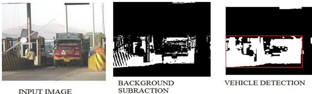
Fig. 3. Simulated output