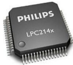
Fig 2: ARM7 LPC2148

LPC2148 is the generally utilized IC from ARM-7 gang. It is made by Philips and it is pre-stacked with numerous inbuilt peripherals making it more effective and a dependable choice for the fledglings and additionally top of the line application engineer.