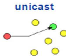
Figure2: Unicast Routing [27]