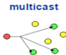
Figure 4: Multicast Routing [27]