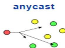
Figure 5: Any cast Routing [27]