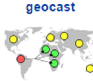
Figure 6: Geocast Routing [27]

H. Geocast that Transforms the Message to Geographic Area