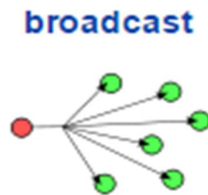
Figure 3: Broadcast Routing [27]