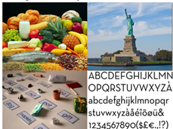
Fig. 5. Sample images used for the testing among participants, each with distinguishable features for selection of cipher sequence

1) Materials : Five source images were selected based on the image categories with highest success rate in prior work [6]. They depicted people, food, tiny objects, and random text. These images were displayed on a Motorola Moto G5 Plus mobile phone with a screen resolution of 1920 x 1080 pixels and each image was preprocessed to match this screen resolution. The required points were chosen in an initial study where seven users (aged between 20 and 25 years) chose four cipher items on the selected images and processed them into the Graphical Cipher Ratification System six times. We chose distinguished points from among the selections—either those that were picked most of the time or, if there was significant variation in the areas selected, one of the items arbitrarily. An example of some of the images used in the study can be seen.