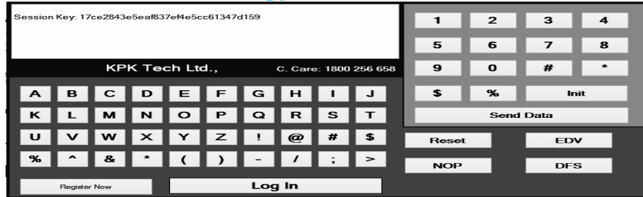
Fig.2 Session key generation

The above two figures shows that the login and session key generation. After successful login the user and the server both agreed on a session key to encrypt the messages passed between them. The message sent by the user will be encrypted and after the server receiving the encrypted data, the message will be decrypted to the server convenience.