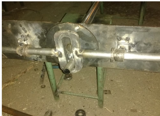
Fig.3. Scotch Yoke Mechanism

Scotch yoke mechanism is most suitable mechanism for our application. It gives optimum cutting requirements and is also easy to implement for our purpose of cutting small stalks.