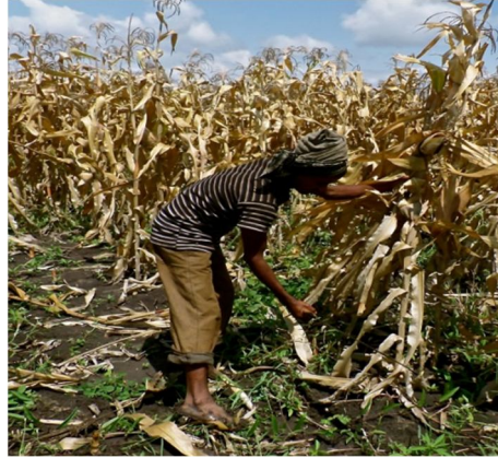
Fig.1. Manual reaping (By Hand)