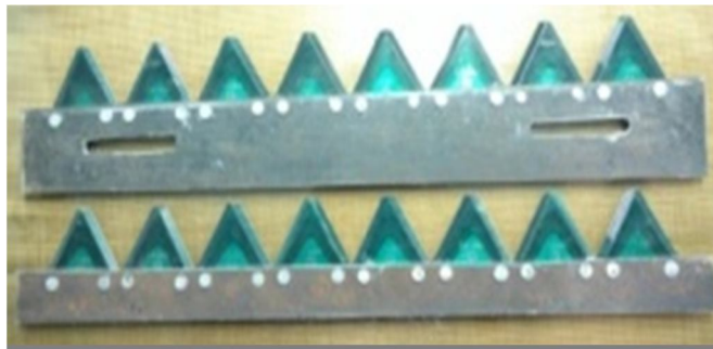
Fig.2. cutters for trimmer mechanism

This mechanism is used in portable trimmers. If the size of cutter is increased it can be used for cutting stalks with moderate diameter.