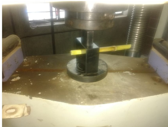
Fig.4.Specimen under Test On UTM

In order to obtain precise values from calculations we performed a test on several stalks of corn plant to obtain shear strength. The shear test was performed on a universal testing machine using suitable fixtures. Stalks were tested for both single and double shear.